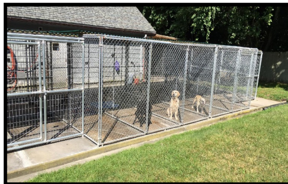
Figure 2 – Dogs Outside at a Shelter

Our visits to 48 shelters showed all of them provided appropriate water and care and tended to any injured dogs. However, we identified relatively minor deficiencies at four shelters related to the shelter condition and food, including cages too small for large dogs, peeling paint, a leaking roof, and recently expired food. Figures 2 and 3 show typical examples of areas where seized dogs are kept.