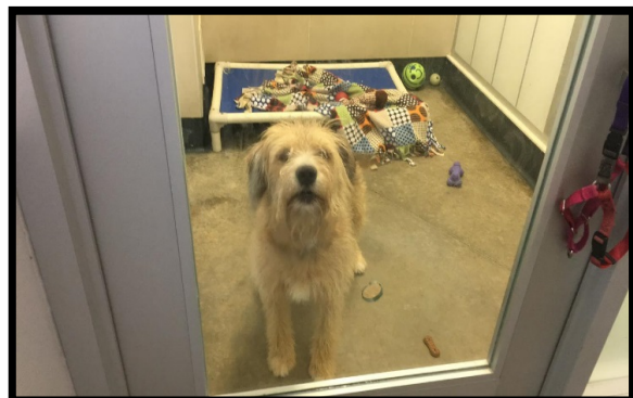
Figure 3 – Dog Inside at a Shelter

We also reviewed disposition records and related documentation for 808 dogs to identify whether or not dogs were held for the full five-day redemption period. We identified nine instances of seized dogs not held for the required holding period at 8 of the 48 shelters. These dogs were adopted, transferred, or euthanized in fewer than five days, or there was insufficient documentation to support the final disposition. Also, the records for the dogs that were