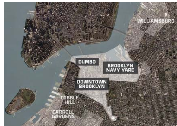
Figure 3 The Brooklyn Tech Triangle

is seeking more commercial space, and public and private investments to support future growth.